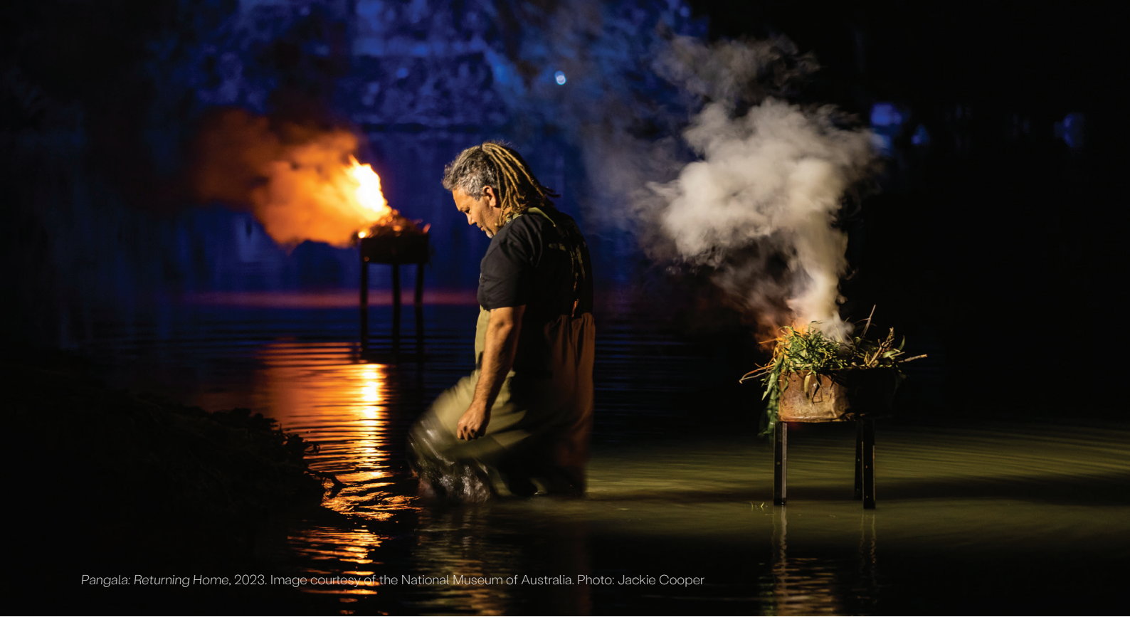
Pangala: Returning Home , 2023.