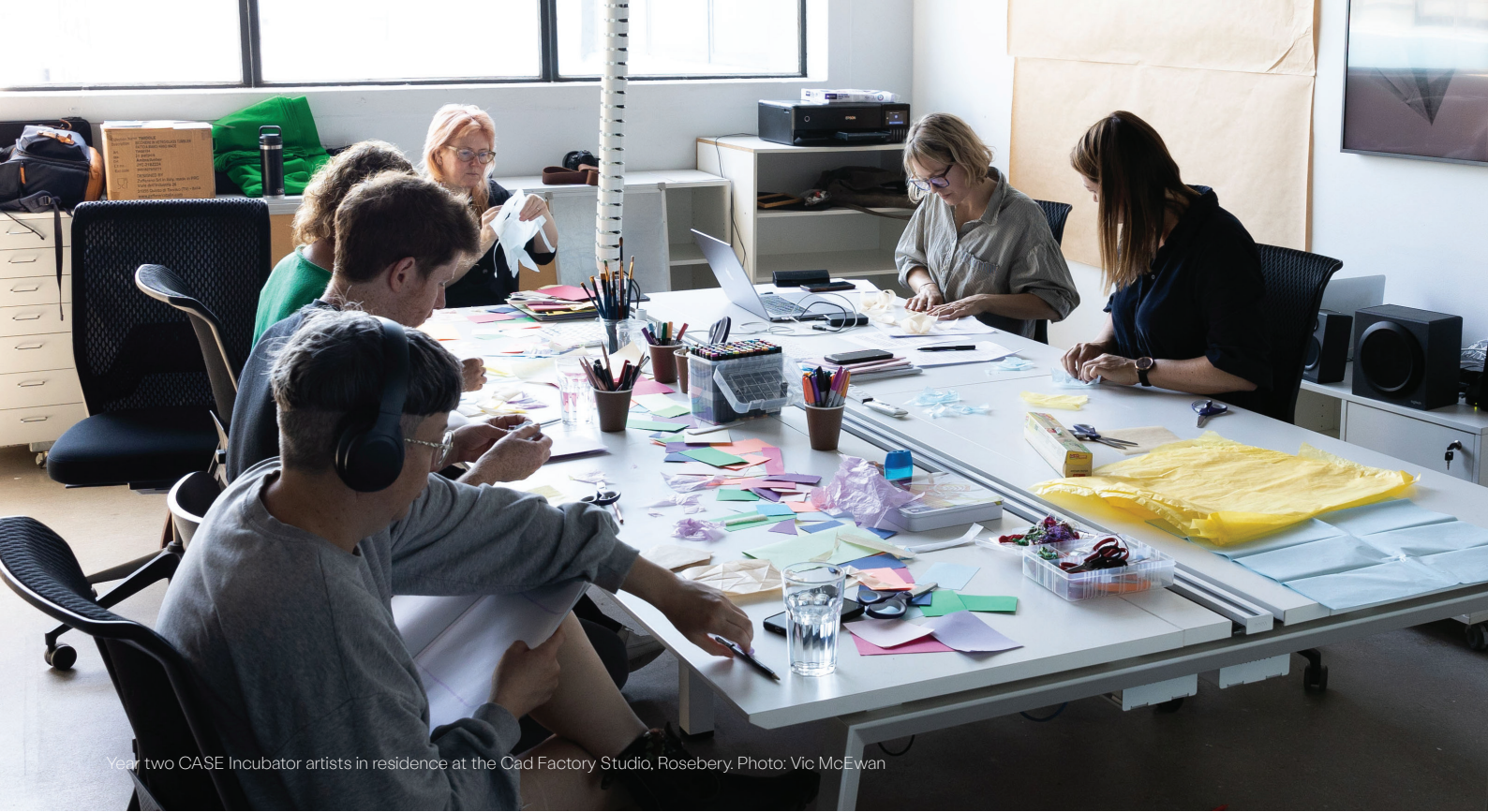
Year two CASE Incubator artists in residence at the Cad Factory Studio, Rosebery.